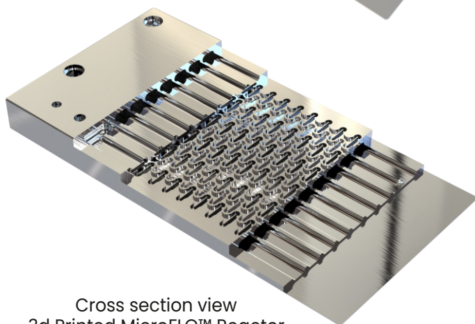
Cross section view 3d Printed MicroFLO™ Reactor